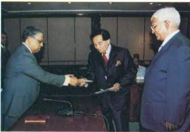
Pragati Insurance Ltd. donated Tk. 10.00 lac to the Chief Adviser's Relief Fund to give succour to flood affected people.