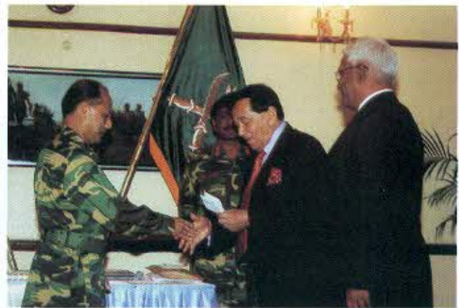
Pragati Insurance Ltd. donated Tk. 10.00 lac to Bangladesh Army Relief Fund for Sidr Victims